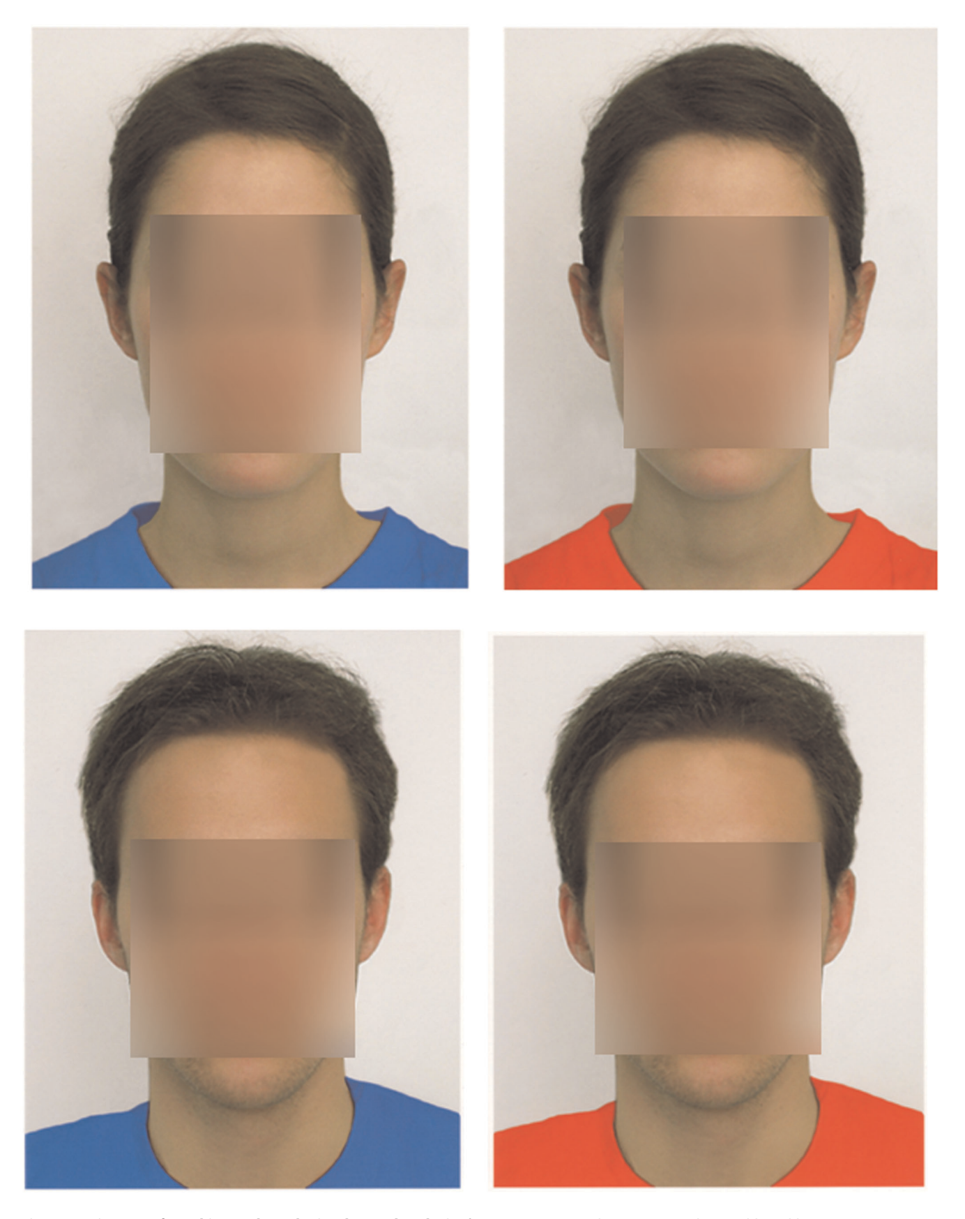
Figure 1. Pictures of "Jackie" and "Jack" in Blue and Red. The faces were intact in the experiment, but are blurred here to protect privacy. doi:10.1371/journal.pone.0040333.g001